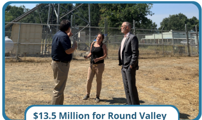
$13.5 Million for Round Valley Indian Tribe Broadband