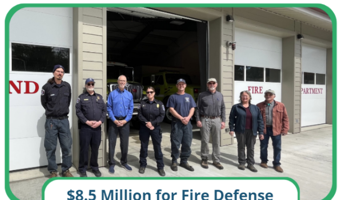
$8.5 Million for Fire Defense and Resilience Projects