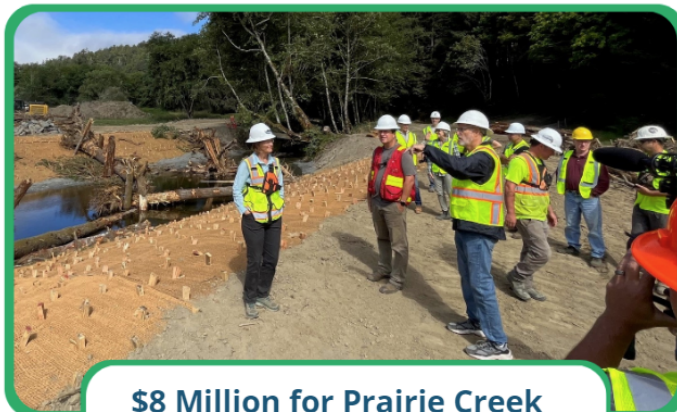
$8 Million for Prairie Creek Watershed Restoration