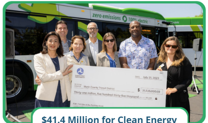
$41.4 Million for Clean Energy Buses in Marin and Santa Rosa