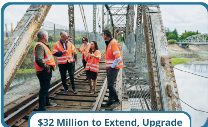
$32 Million to Extend, Upgrade SMART Passenger Rail