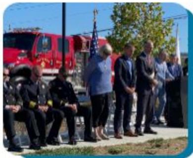
Rep. Huffman at event remembering the 2017 Sonoma Wildfires.

Our community knows all too well the devastation caused by natural disasters – including wildfires, droughts, and floods – and through season after season we've grown together, creating a stronger and more resilient community that better prepares for and responds to disasters.