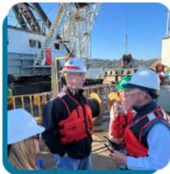
Rep. Huffman receives an update from the Army Corps on the San Rafael Dredge operation.

In the 117th Congress, I was also able to help pass the Infrastructure Investments and Jobs Act into law – and as a result, brought home vital funding to rebuild our region's crumbling infrastructure. Through this law, we've been able to get funding to repair ports and harbors, expand high-speed internet access on tribal land, rebuild dilapidated bridges, and more.