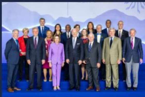
Rep. Huffman stands with President Joe Biden and the congressional delegation at COP27 in Egypt.

As a member of the Select Committee on the Crisis, I've helped lead the charge to advance policies to tackle the climate emergency. In the committee's Climate Crisis Action Plan, we included more than 700 policy recommendations to build a clean energy economy, advance environmental justice, and reduce greenhouse gas emissions. Since its release, Congress has successfully turned more than 300 of those solutions into law, and more than 400 of the plan's recommendations have passed the House. We also recently released our final report, which highlights our many wins and provides a roadmap for the future of climate action in Congress.